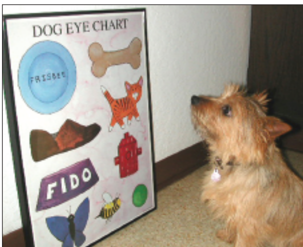
Figure 1. Assessing the vision of dogs is more challenging than asking them to read an eye chart.

Vision is, of course, essential for successful navigation to avoid obstacles, but a blind dog in a familiar environment may seem to have nearly normal vision. I am often presented with a dog for which the owners report an